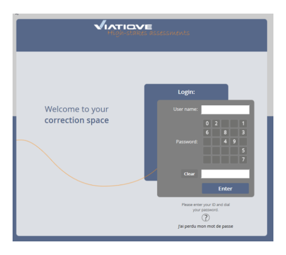
Figure 1- Login screen to the on-line correction platform

Viatique by Neoptec is the on-line correction platform that the European and Accredited Schools will start using from the next 2017 European Baccalaureate session. It has the highest security measures and complies with European data protection standards. It has very user-friendly, multilingual and intuitive interfaces. This application will facilitate the work of the correctors and help increase the transparency and quality of the European Baccalaureate assessment.