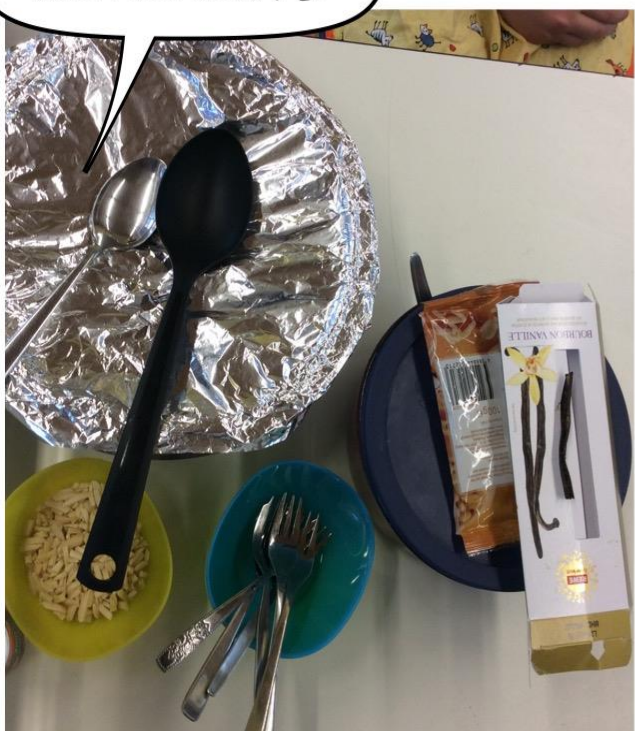
RICE PUDDING INGREDIENTS