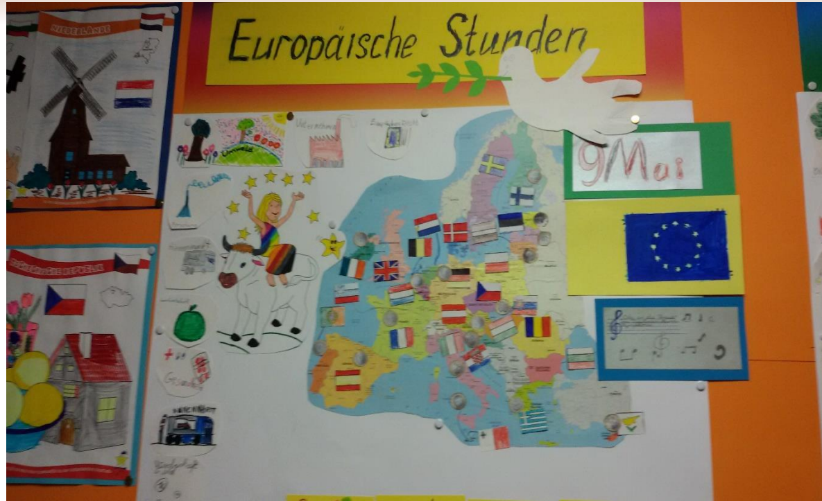
Examples of projects about Europe and the countries in Europe