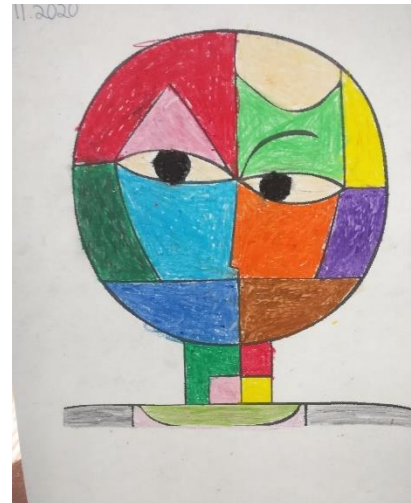
Examples of EU art projects class 4 & 5