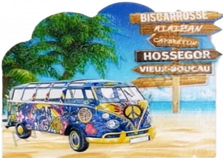
Biscarrosse, Hossegor, France

This fridge magnet has the shape of waves and there is a typical surfer van on it .