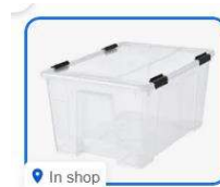
In shop IKEA SAMLA box with lid/clip lock